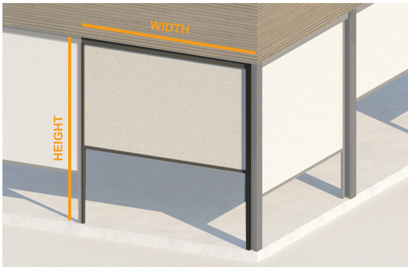
This image is a representation of a product called Motorised Blind (Sun Store - Horizontal)