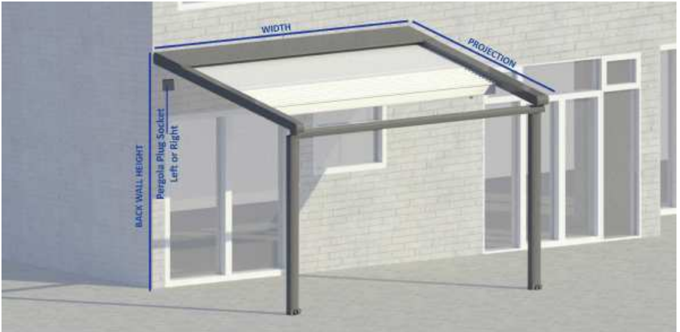
This image is a representation of a product called SUBULATE Ouercus Minima.